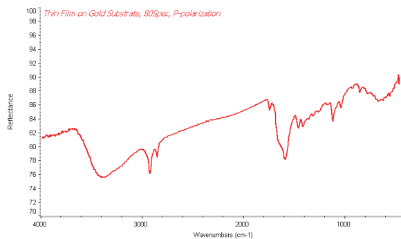
FTIR spectrum of an ultra-thin film on a reflective substrate using p-polarized IR beam.